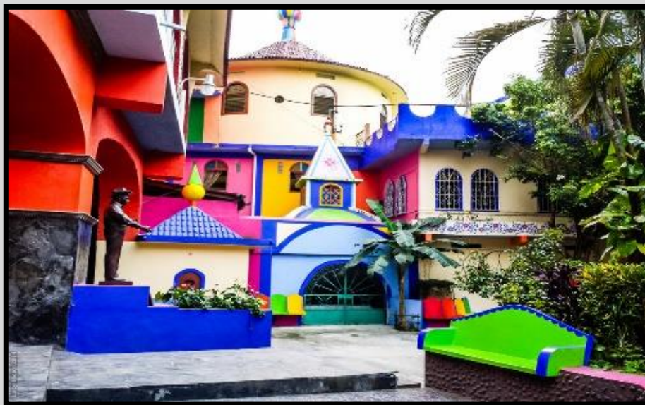
Castle of the Health in Axtla