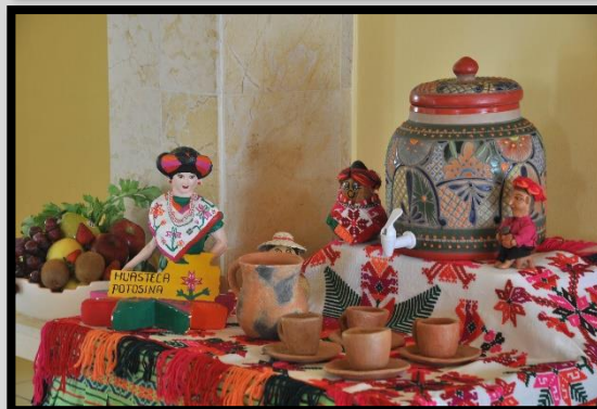
Lobby, Restaurant, Pool and Habitation at Hotel Mision in Ciudad Valles