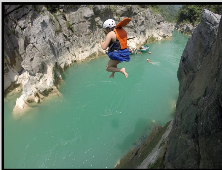
Rafting in Tampaon River