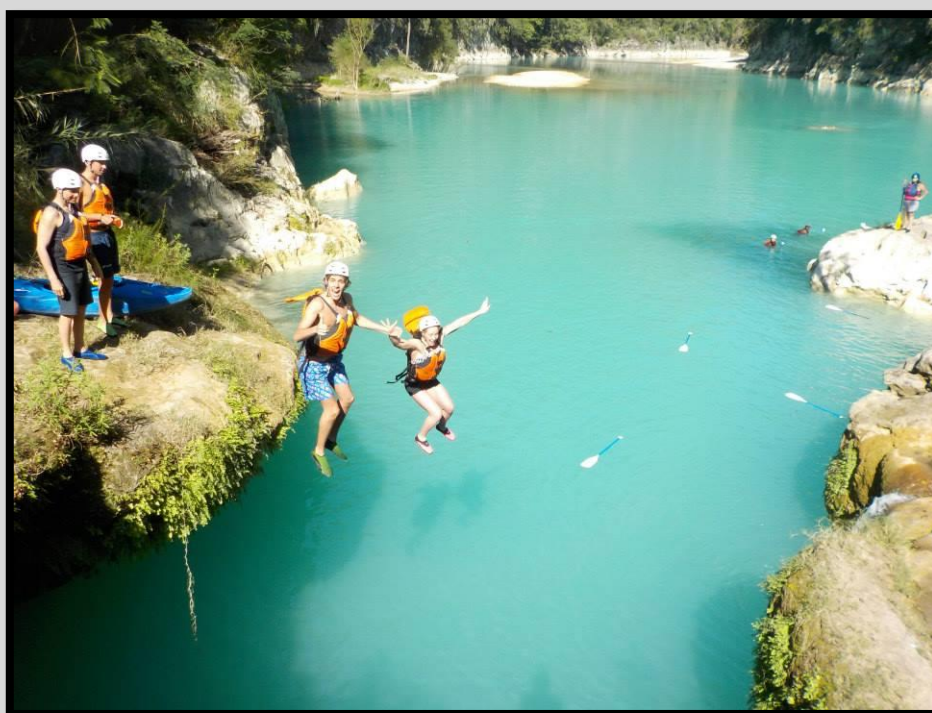
Rafting in Puente de Dios

Between valleys planted sugar cane are two falls of water 50 m height, surrounded by lush vegetation, forming several pools. Here you can swim, observe the turquoise blue of the water and take the best pictures from their viewpoints.