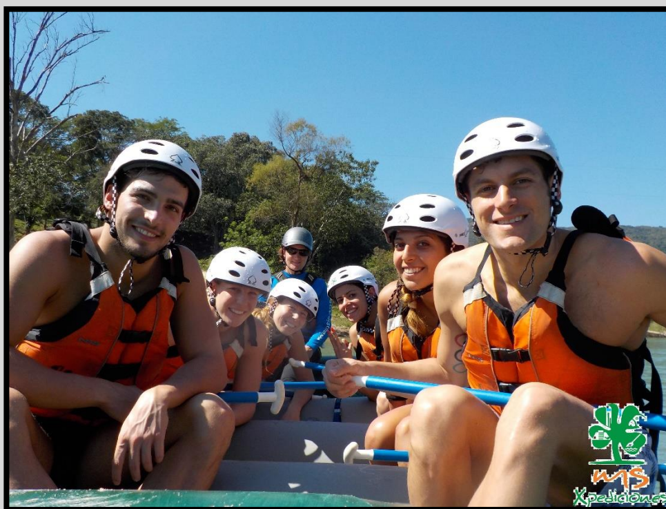
Italian Swimming Team making Rafting in La Huasteca with MS Xpediciones