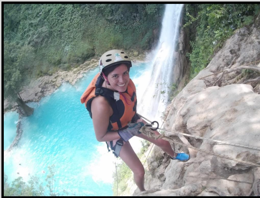
Rappel in Minas Viejas

Is the highest waterfall in the State of San Luis Potosí which is 105 meters it is formed to fall Gallinas river on the Sta. Maria river, and taking the name of Río Tampaón to the gather. We can admire it embarking on a canoe upstream sailing through a Canyon in calm waters turquoise color which offers spectacular views through the "Cave of the water", a flooded cave which is ideal for swimming.