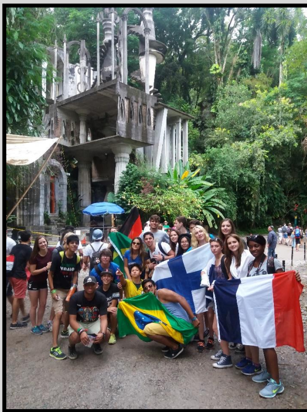
Rotary International Students in Xilitla with MS Xpediciones

MS Xpediciones reserves the right to modify tours due to causes of force majeure or climatic changes having as a priority the security of our customers.