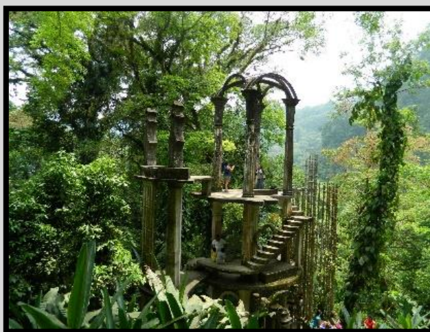
Surreal Garden of Edward James in Xilitla