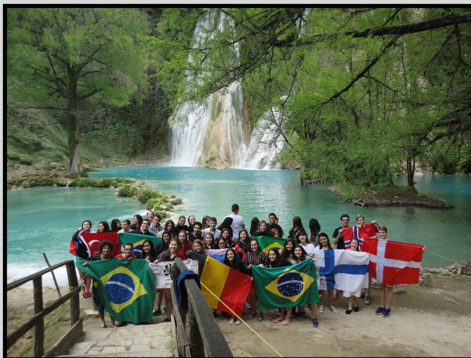
Rotary International Students in Minas Viejas with MS Xpediciones