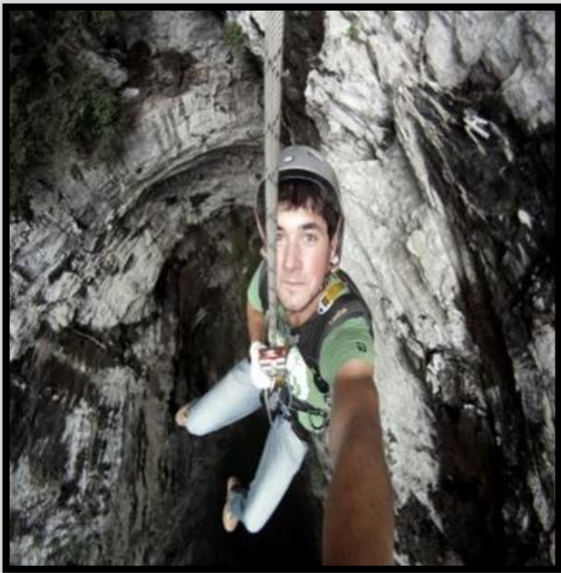
Basement of Golondrinas