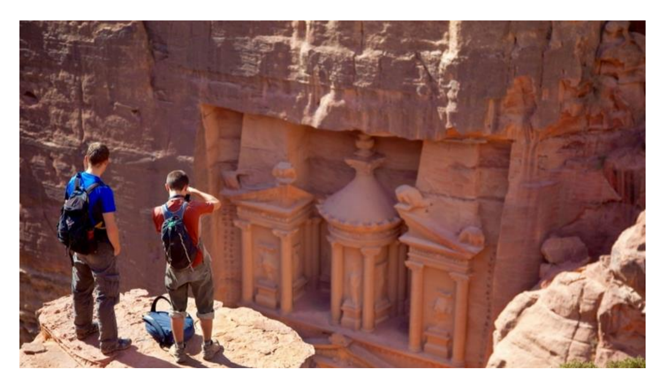
Day 6 - May 15

Breakfast – Seven Wonders Lunch – Basin Restaurant Dinner – Petra Hotel