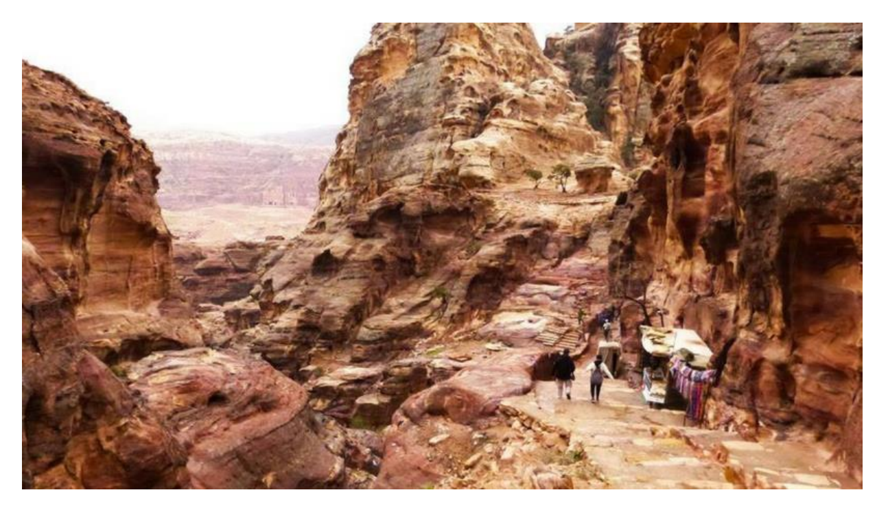
Trip Rating: 3 - Moderate (Good physical fitness required; ~4-6 hours activity/day) Some days will be easy and some days will be up hill, but no special technical skills are required