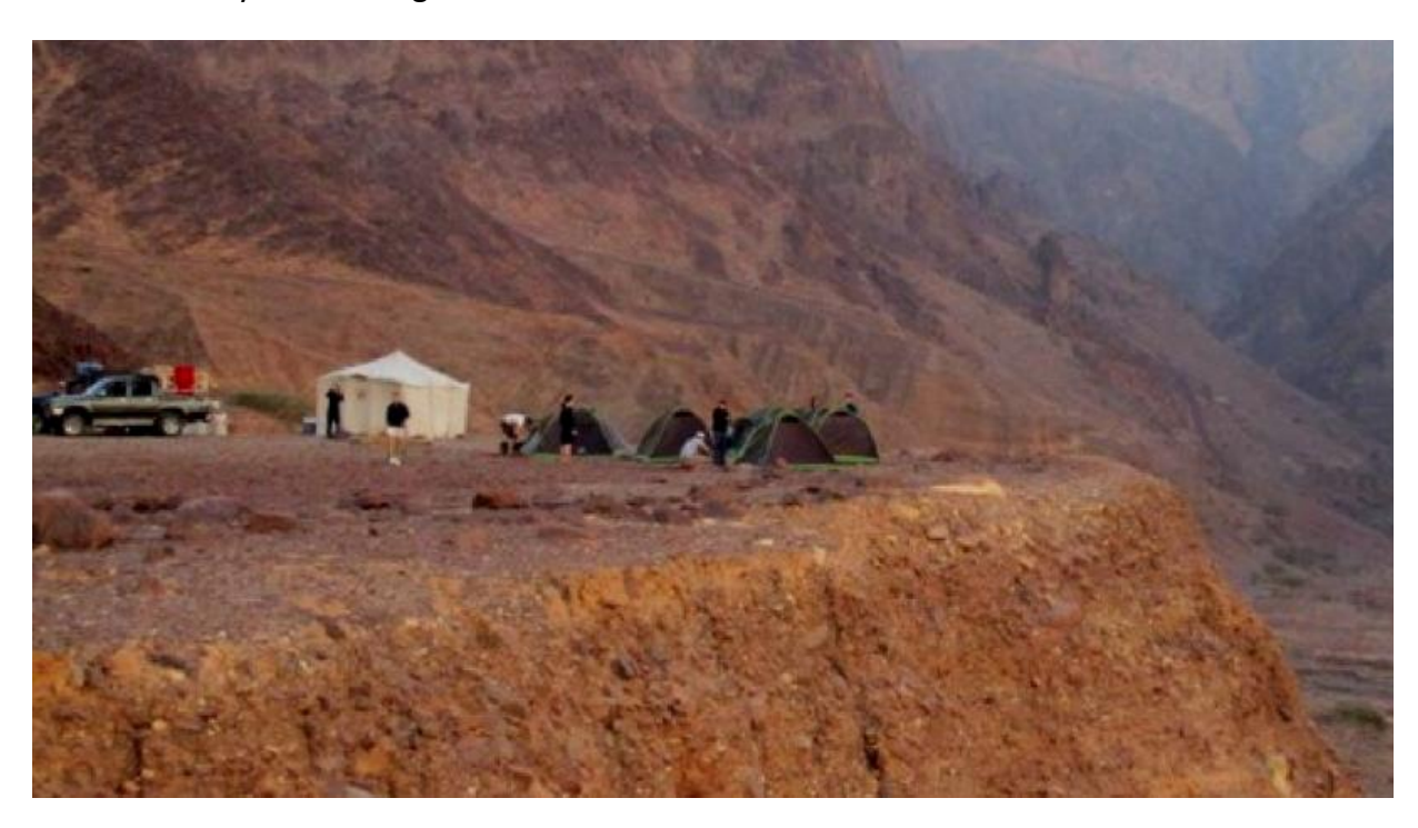
Day 3 - May 12

Breakfast – Feynan Ecolodge Lunch – Lunch Box Dinner – Cooked Meal